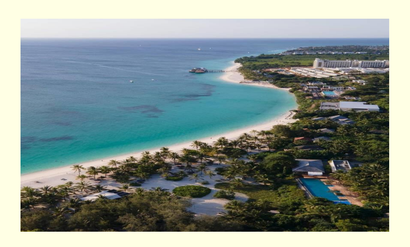
TOURISM STATISTICAL RELEASE APRIL – 2023